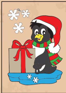
FRONT OF CARD

After you finish colouring, cut out and paste your design on the card found in the red envelope.